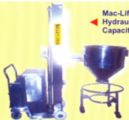
Mac-Lifton Electro Hydraulic Mobile LPD. Capacity 250-300 kg