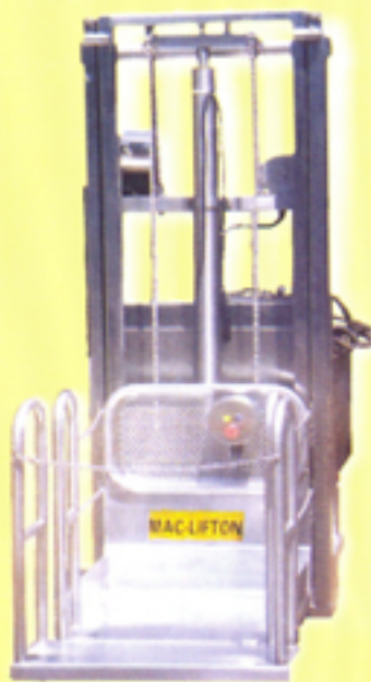
ML 316 Telescopic Type Order Picker. Lift 12'. Cap. 500 kg