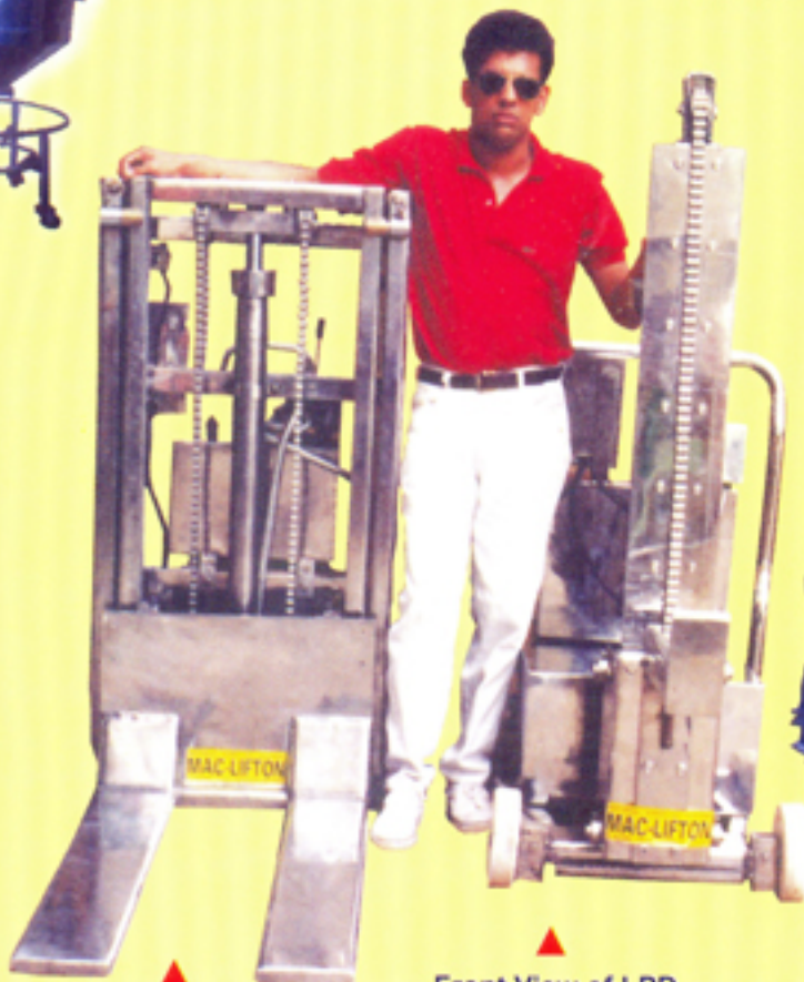
Mac-Lifton Electro Hydraulic Telescopic Mast Stacker. Lift 6' Capacity 250-500 kg