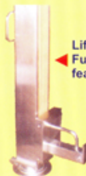
360° rotation - boom