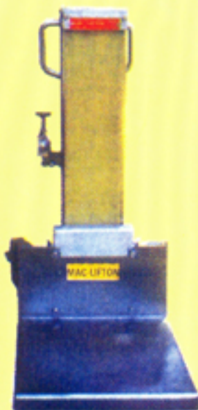
Fully S.S. 304 Platform Stacker. Lift 2' Cap: 200 kg