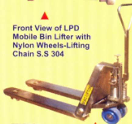
Heavy Duty SS 304 Hydraulic Pallet Trolley PT - 2