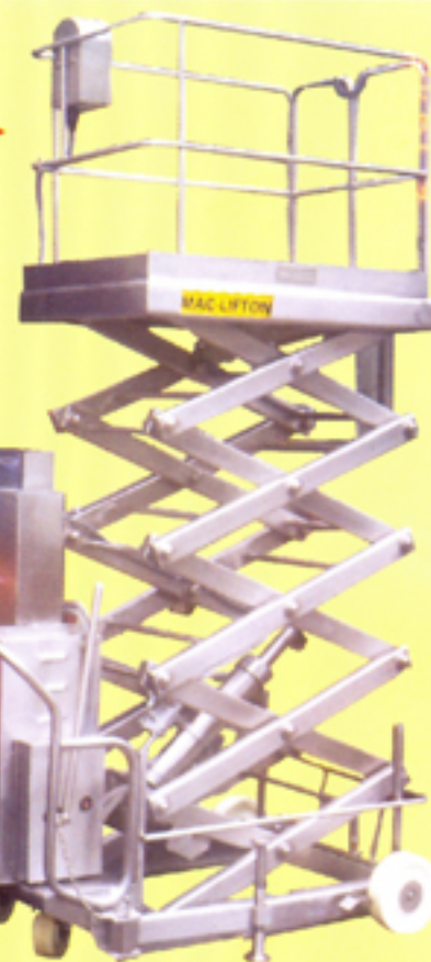
Multiple High-rise Scissor Lift with Safety Railings Lift 2500 mm - 3000 mm. Cap: 250 kg. P.Size 1100 x 700