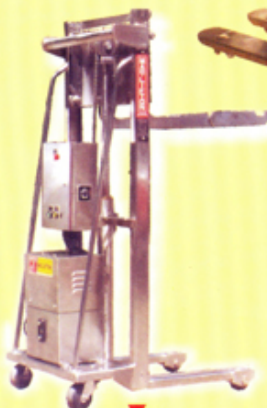
Fully S.S. Special Purpose Stacker