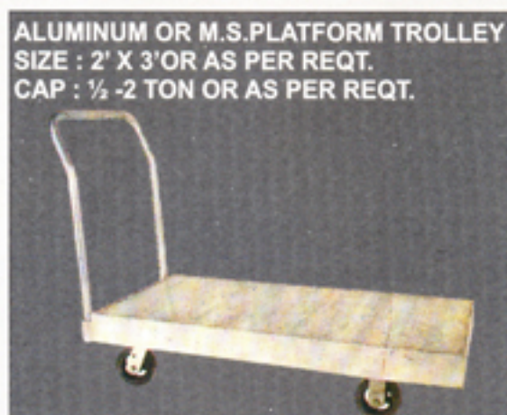
ALUMINUM OR M.S. PLATFORM TROLLEY SIZE : 2' X 3' OR AS PER REQ. CAP : ½ - 2 TON OR AS PER REQ.