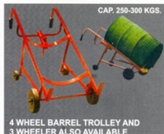
CAP. 250-300 KGS.