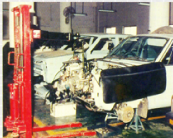
HYDRAULIC ENGINE HANDLER CAPACITY. 300 KGS