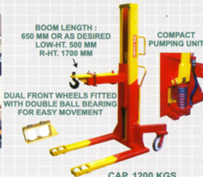
BOOM LENGTH : 650 MM OR AS DESIRED LOW-HT. 500 MM R-HT. 1700 MM COMPACT PUMPING UNIT DUAL FRONT WHEELS FITTED WITH DOUBLE BALL BEARING FOR EASY MOVEMENT