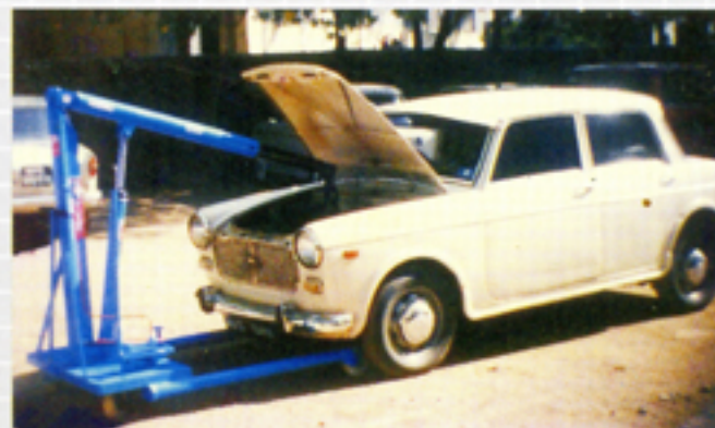
HYD. ENGINE LIFTING CRANE ½ TON MODEL TELESCOPIC BOOM