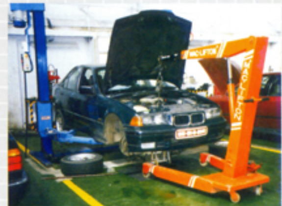
HYD. ENGINE LIFTING CRANE CAP. ½ TON TO 1 TON. BOOM LENGTH : 1370 MM OR AS DESIRED