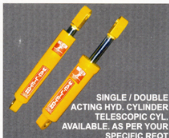
SINGLE / DOUBLE ACTING HYD. CYLINDER TELESCOPIC CYL. AVAILABLE. AS PER YOUR SPECIFIC REQ