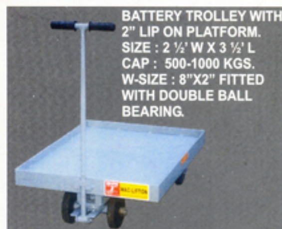
BATTERY TROLLEY WITH 2" LIP ON PLATFORM. SIZE : 2 ½' W X 3 ½' L CAP : 500-1000 KGS. W-SIZE : 8" X 2" FITTED WITH DOUBLE BALL BEARING.