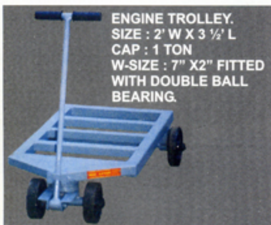
ENGINE TROLLEY. SIZE : 2' W X 3 ½' L CAP : 1 TON W-SIZE : 7" X 2" FITTED WITH DOUBLE BALL BEARING.