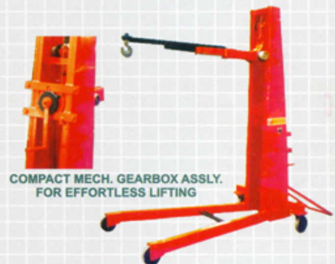
COMPACT MECH. GEARBOX ASSLY. FOR EFFORTLESS LIFTING