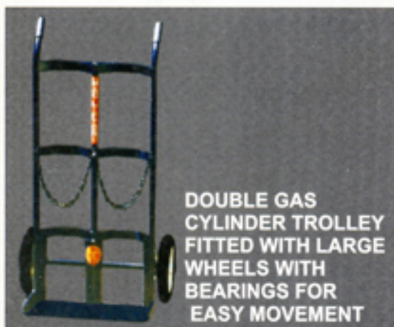
DOUBLE GAS CYLINDER TROLLEY FITTED WITH LARGE WHEELS WITH BEARINGS FOR EASY MOVEMENT