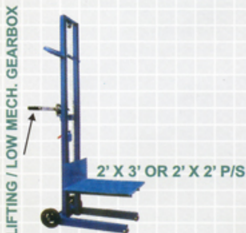
LITE LOAD LIFTS CAP. 250/300 KGS. LIFT 5'