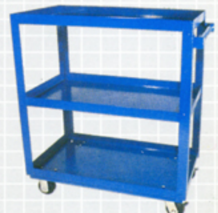
SERVICE CART STEEL OR ALUMINUM CONST. 2" LIP. CAP. : 500 KGS.